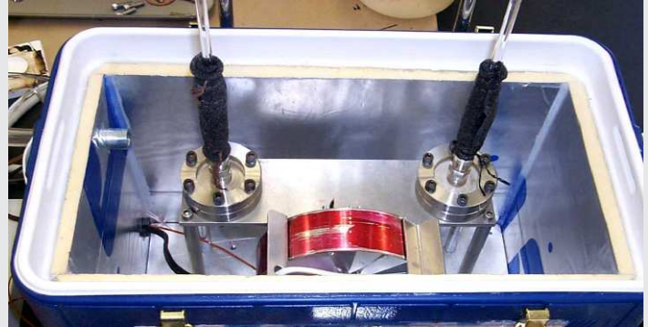
Measuring thermo-volumetric properties of modified binders, such as specific volume versus temperature, can explain how engineered modified asphalts could reduce thermal cracking.

The team has developed detailed plans to advance understanding of warm mix and cold mix additives. The team will also join other ARC partners to develop improved methods to characterize binders in recycled asphalt pavements and to estimate the binder grade changes needed when high percentages of RAP are used in mix designs.